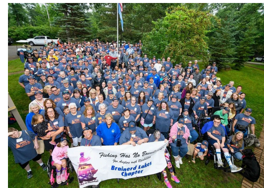
Our 2022 Group Photo